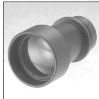
3 X Long eye relief eye piece (option)